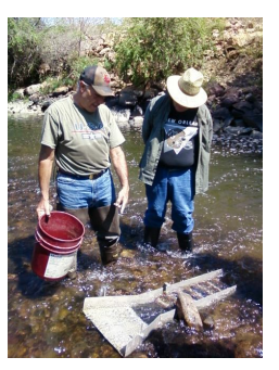
From the Webmaster

If you haven't had a chance to take a look of the videos available on the web site. When we have guest speakers or something special going on at the meetings I will record it and list it here. These are not streaming videos so download and save them to your computer. Then run it.