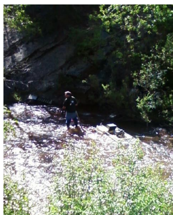
Lloyd Lauck at work