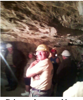
Being underground is exciting to some folks..!