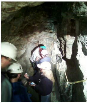
There is still gold in them thar hills..!!!