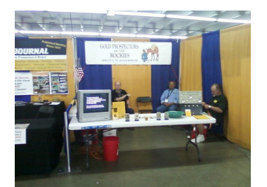
The GPR booth