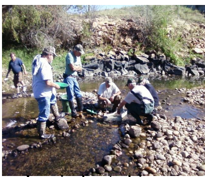
Learning how to sluice