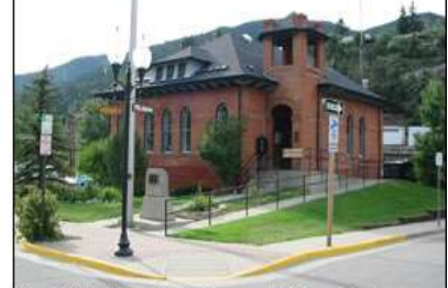
City Hall Building, 17th Avenue & Miner Street

Idaho Springs continues to benefit from its rich mining heritage. The Idaho Springs Downtown Commercial District was