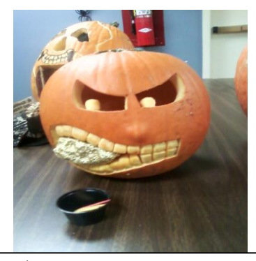
3<sup>rd</sup> Place by Melanie Chavez