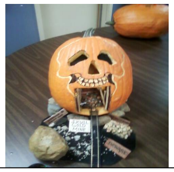
2<sup>nd</sup> Place by Barbara Barrow