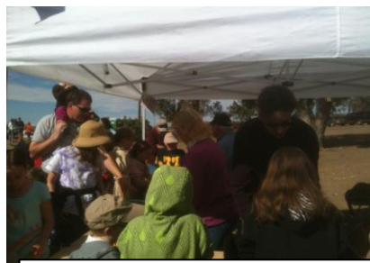
Lots and lots of folks