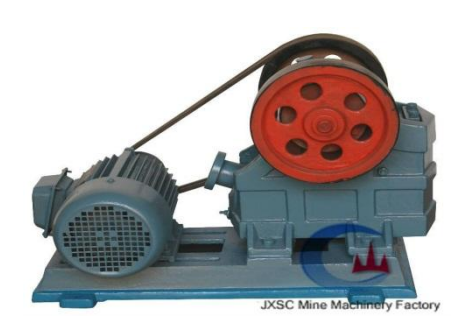
Table top crusher

Mining operations use crushers, commonly classified by the degree to which they fragment the starting material, with primary and secondary crushers handling coarse materials, and tertiary and quaternary crushers reducing ore particles to finer gradations. Each crusher is designed to work with a certain maximum size of raw material, and often delivers its output to a screening machine which sorts and directs the product for further processing. Typically, crushing stages are followed by milling stages if the materials need to be further reduced. Additionally rockbreakers are typically located next to a crusher to reduce oversize material too large for a crusher. Crushers are used to reduce particle size enough so that the material can be processed into finer particles in a grinder. A typical processing line at a mine might consist of a crusher followed by a SAG mill followed by a ball