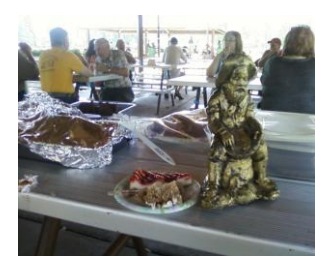
Annual Club Picnic at Morse Park